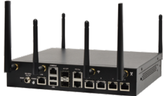
Images are for reference only. See ordering information for SKU details.